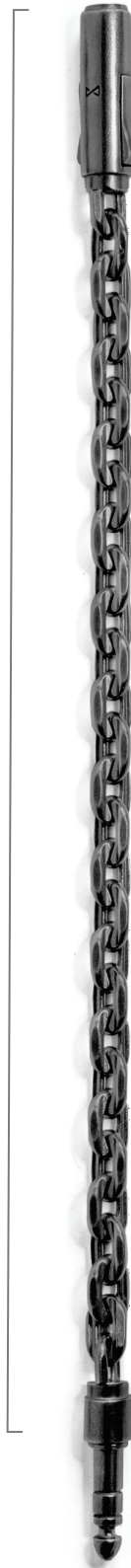
SMALL 7.5" 19 cm